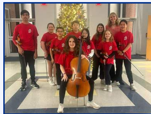
Strings students performed a Christmas concert on December 2nd in the MMS entryway.

Our 8th-grade science team went to the National Conference on Science Education in New Orleans. They learned about new and exciting ways to maximize instruction for our students.