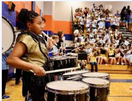
Golden Era Pep Rally

Jammin in the Jungle is October 25 . Our 8th graders will perform with the high school band at the Madison Central v. Germantown football game! Come enjoy the fun!!!